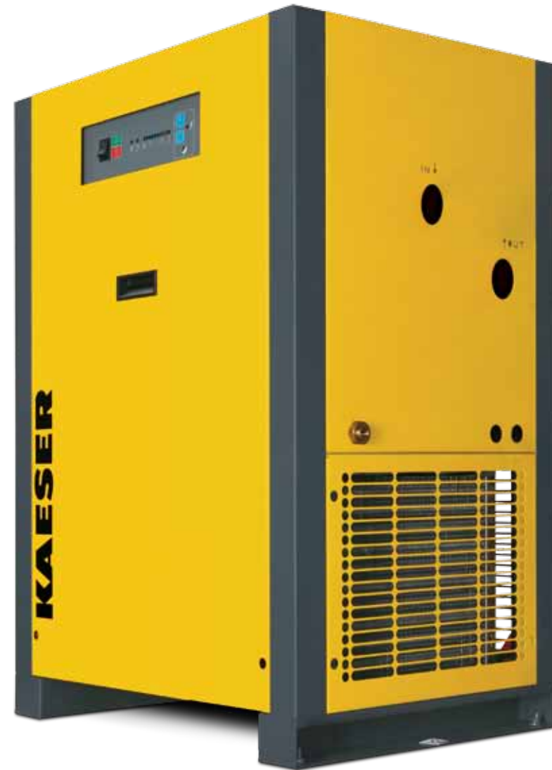
Standard version THP 40-50