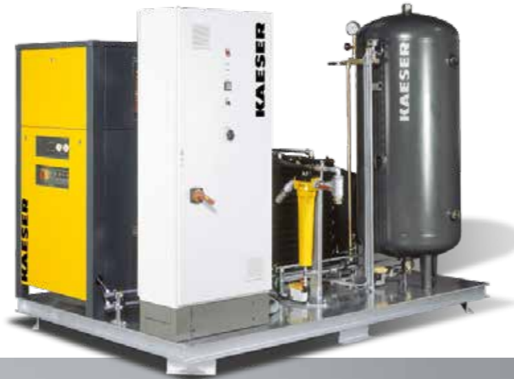
SIGMA PET AIR Packages

KAESER skid solutions are suitable for oil and gas applications with ambient temperatures of up to 60 °C, high sand load and for installation under a flying roof.