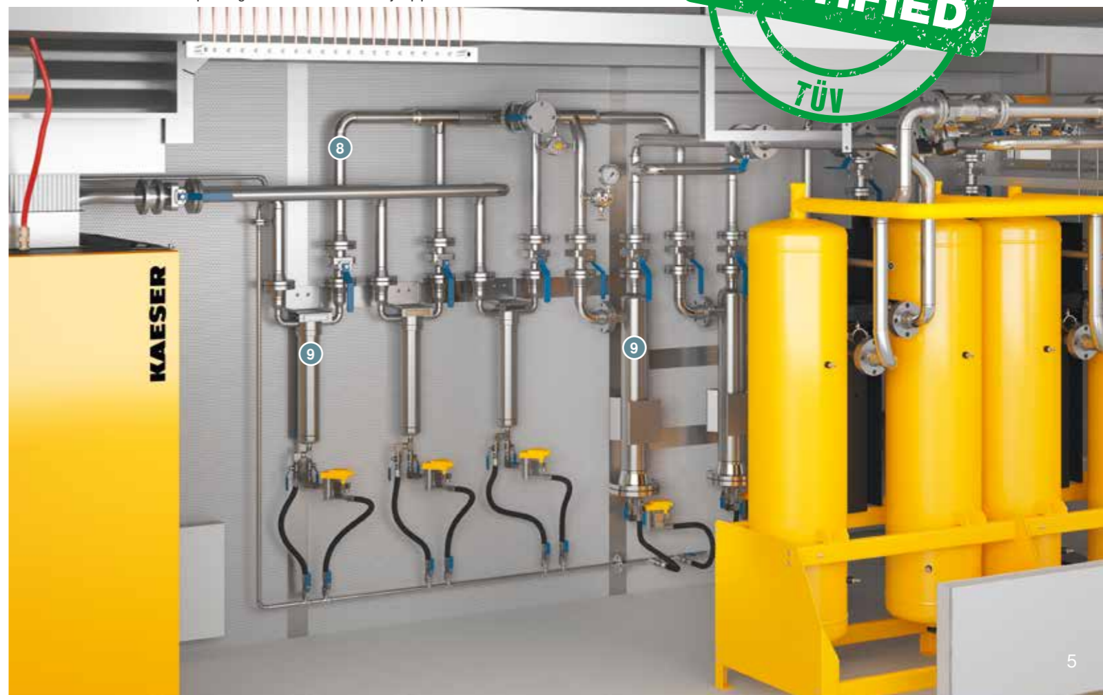
Container 3-D planning for filter and desiccant dryer pipework

If necessary for environmental or other reasons, the container floor can be designed as an oil-tight pan.