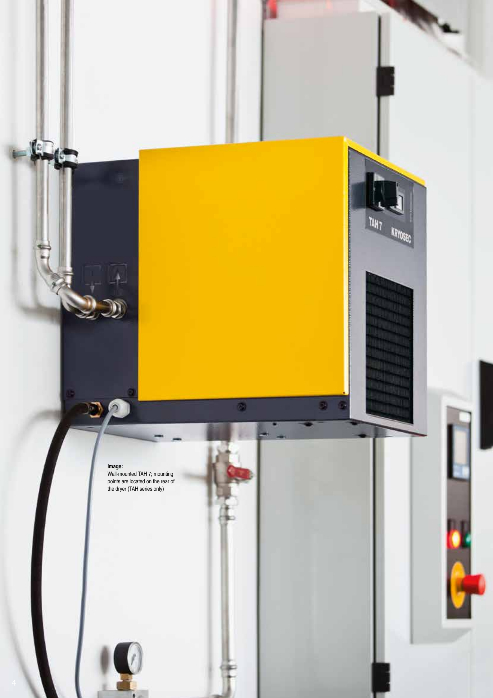
Image: Wall-mounted TAH 7; mounting points are located on the rear of the dryer (TAH series only)