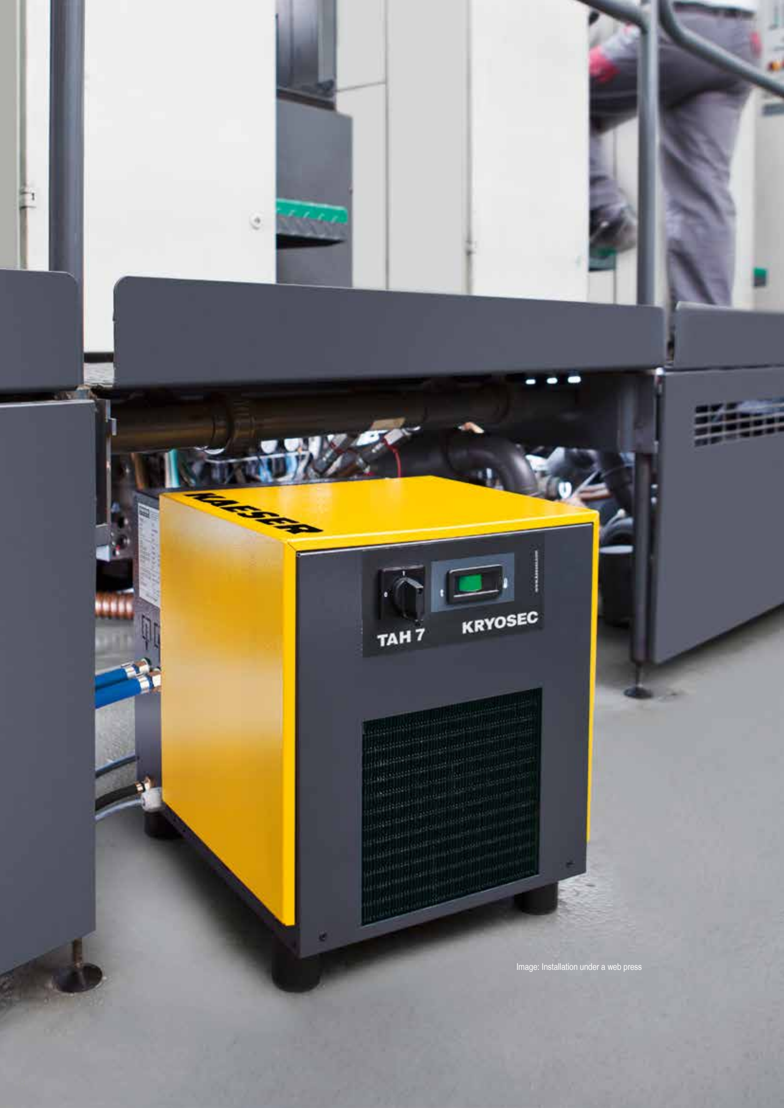
Image: Installation under a web press